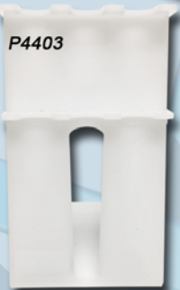
3-Place Rack up to one multi-channel

2600A Main Street Extension Sayreville, NJ 08872 Ph: 908-279-0280 www.mtcbio.com