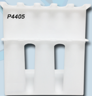
5-Place Rack up to two multi-channels